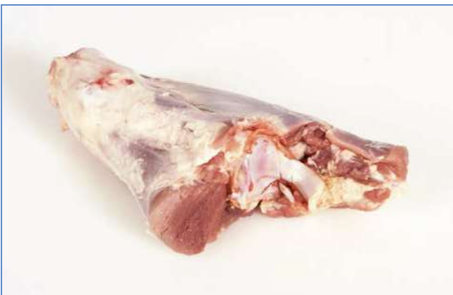
4 Shank – forequarter, rindless.