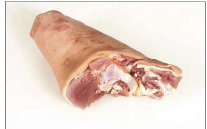
3 The rind is removed from the Shank.